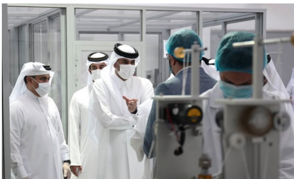
His Excellency Sheikh Khalid bin Khalifa bin Abdulaziz Al Thani , Prime Minister and Minister of Interior, during his visit to Almaha Medical Supplies Factory - April 2020