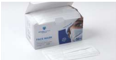
White Ear Loop Face Mask