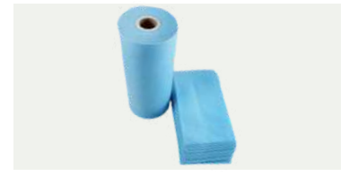
Bed Roll & Sheet