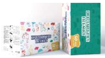
Ear Loop Kids Face Mask