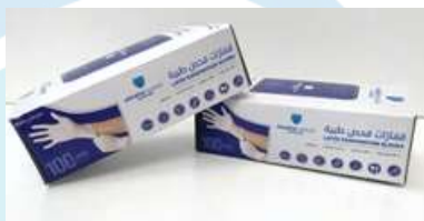
Latex & Nitrile Gloves