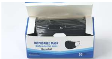
Black Ear Loop Face Mask