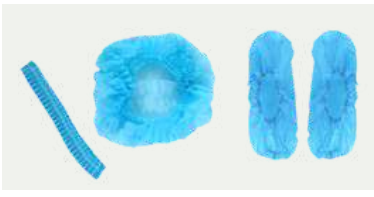
Head & Shoe Cover