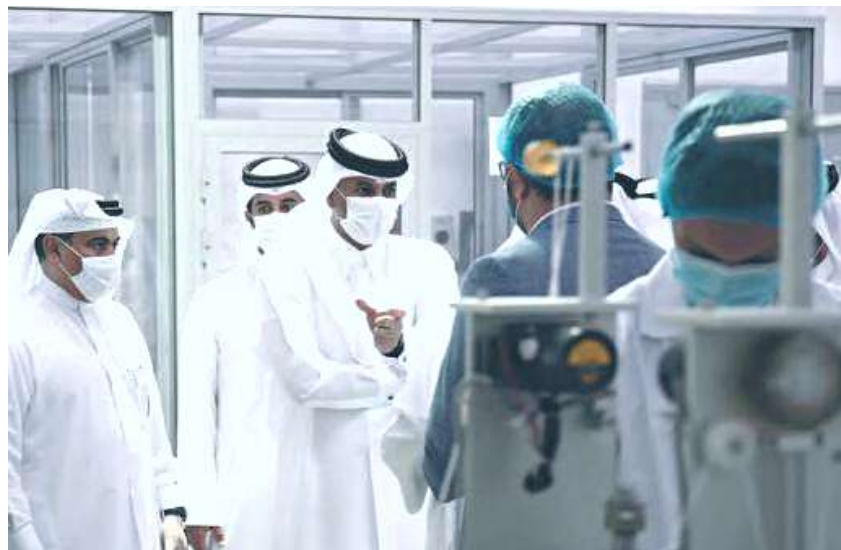
His Excellency Sheikh Khalid bin Khalifa bin Abdulaziz Al Thani, Prime Minister and Minister of Interior, during his visit to Almaha Medical Supplies Factory - April 2020