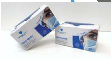
Blue Ear Loop Face Mask