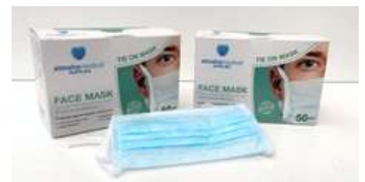
Blue Tie On Face Mask